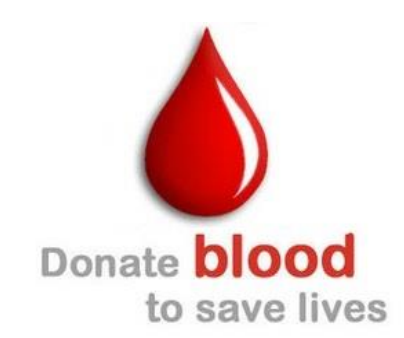
Founder of Red Cross